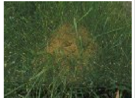
Mound in grass

Interstate shipments of nursery stock can carry this invader into your nursery, garden center, or home landscape.