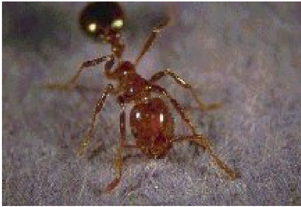
Red imported fire ant ( Solenopsis invicta )