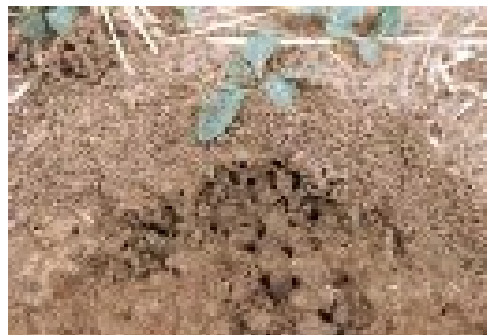
Fire ant "honeycomb" nest