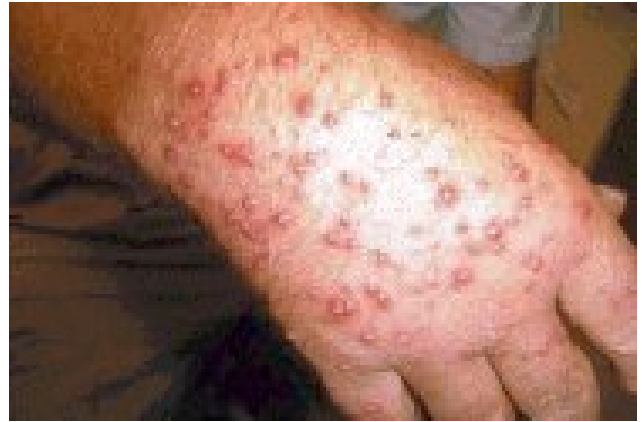
Pustules from fire ant sting

The red imported fire ant is a serious stinging pest threatening agriculture and human health in the United States.