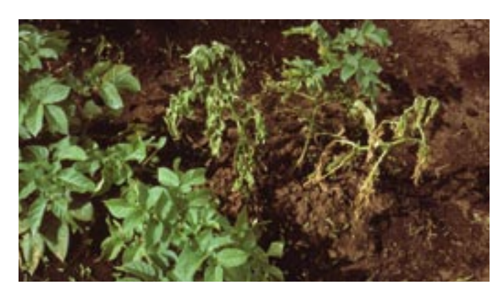
Potato plant infected by R. solancearum R. 3, B. 2

In potato, clean seed is essential for avoiding R. solanacearum race 3 biovar 2.