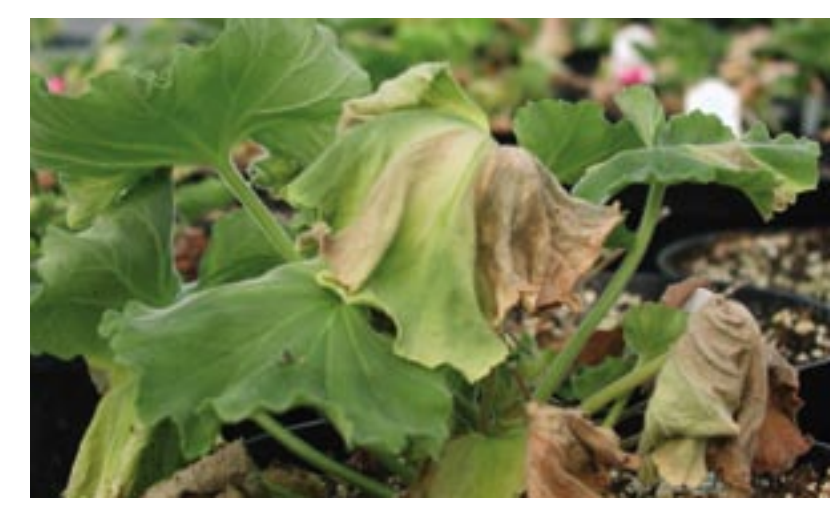
Geranium plant infected by R. solanacearum R. 3, B. 2, exhibiting southern wilt symptoms.

Symptoms of potato brown rot (also known as bacterial wilt) include wilting, stunting, and yellowing of the foliage, and eventually death. Leaves often curl upwards and symptoms may occur at any stage of potato growth. Wilting may be severe in young plants of highly susceptible varieties. Often, one branch in a hill may show wilting. With rapid disease development, all stems in a hill may