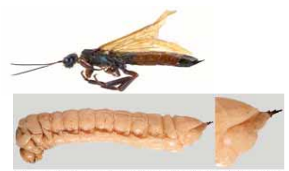
Figure 3. Sirex noctilio-larva and close-up of posterior spine.

The wood wasp Sirex noctilio is considered a secondary pest within its native range (Europe), but proved to be a very serious pest of Pinus when introduced into Australia, New Zealand, and South America. Much of the insect's pest status results from its association with the phytotoxic fungus Amylostereum areolatum , which female wasps inject into trees (along with a toxin) at the time of oviposition. Larvae burrow into the tree, but apparently derive much of their nutrition from feeding on the fungus.